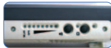
Front view, close-up